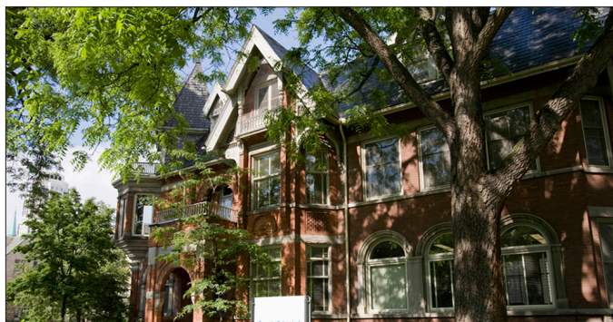
The main offices of the Toronto School of Theology

The Metropolitan Andrey Sheptytsky Institute of Eastern Christian Studies plans to offer Eastern Christian Studies streams through the University of St. Michael's College in the University of Toronto, in both of the professional degree programs: the Master of Theological Studies (M.T.S.) and Master of Divinity (M.Div.) degrees. Pending approval from the Toronto School of Theology, the Sheptytsky Institute plans to offer the following courses at the Basic Degree (professionally oriented) level ( M.Div. and M.T.S. ) during the 2017-2018 academic year.