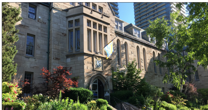
Part of the campus of the University of St. Michael's College