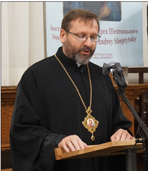
Patriarch Sviatoslav speaking at the University of Saint Michael's College

I know a thing or two about the Metropolitan Andrei Sheptytsky Institute of Eastern Christian Studies; I am one of the Institute's former students. Moreover, the professors of the Institute have played an important role in forging a way forward for our Church in the world. Our Church of Kyiv is now a global Church, with structures on five continents. It is incredibly significant that the Sheptytsky Institute will now be located at one of the world's top research universities. This is a sign of our Church coming of age.