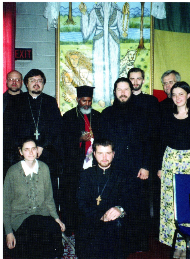
Above right: A visit to an Ethiopian Orthodox Church outside Toronto during a summer session in Orangeville. For the students from Ukraine, who formed a large part of the student body that summer, this was a rare opportunity to meet representatives of the ancient Church.