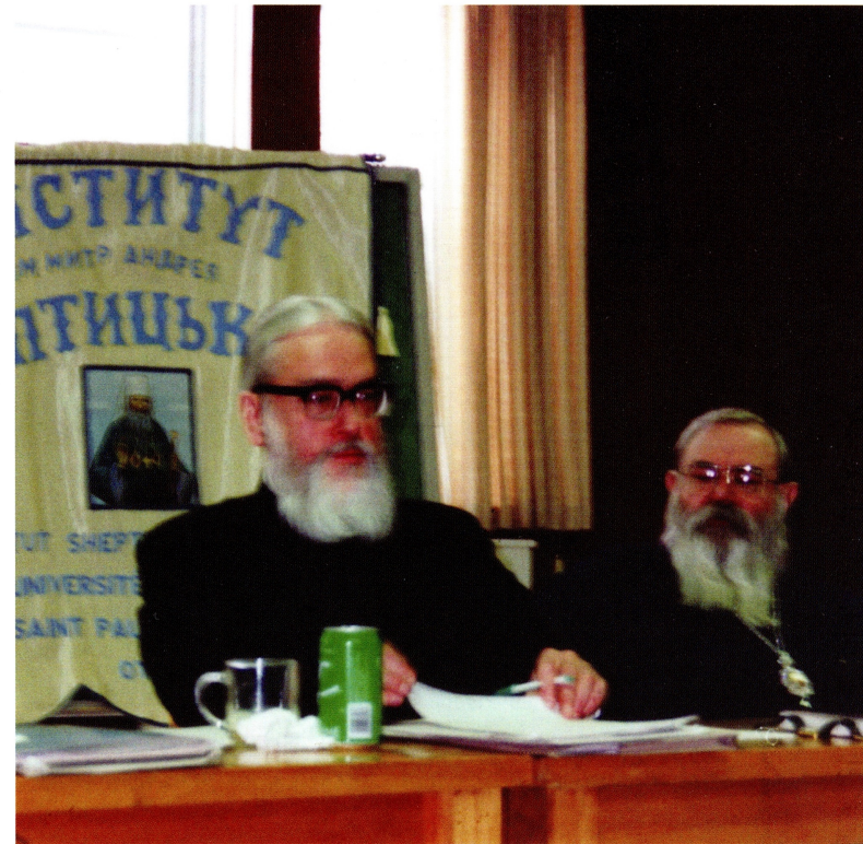
Bishop Kallistos and Archbishop Vsevolod at the Sheptytsky Institute in April, 1993 during a meeting of the Kyivan Church