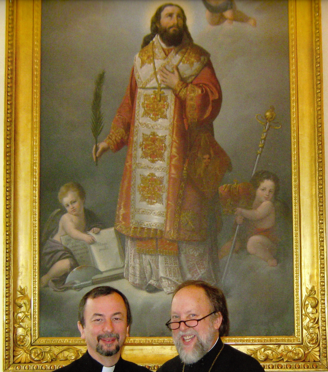
Right: After a meeting with Archbishop Cyril Vasil, SJ, beloved secretary of the Sacred Congregation of the Eastern Churches, Rome, 2009.