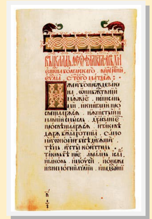
Facsimile of the Peresopnytsia Gospel (Ukraine, 16th century) - located at Saint Paul University

To register for the credit courses contact the Sheptytsky Institute at 613-236-1393, ext. 2332 Toll-free: 1-800-637-6859, ext. 2332